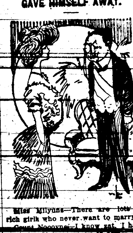
IN THE PLAY

Account this occasion Southern Railway will sell on June 18, 19, 20, 21, 22, July 2, 3, 1912, greatly reduced round trip tickets from Washington, D. C., to Baltimore, Md., and vice versa.